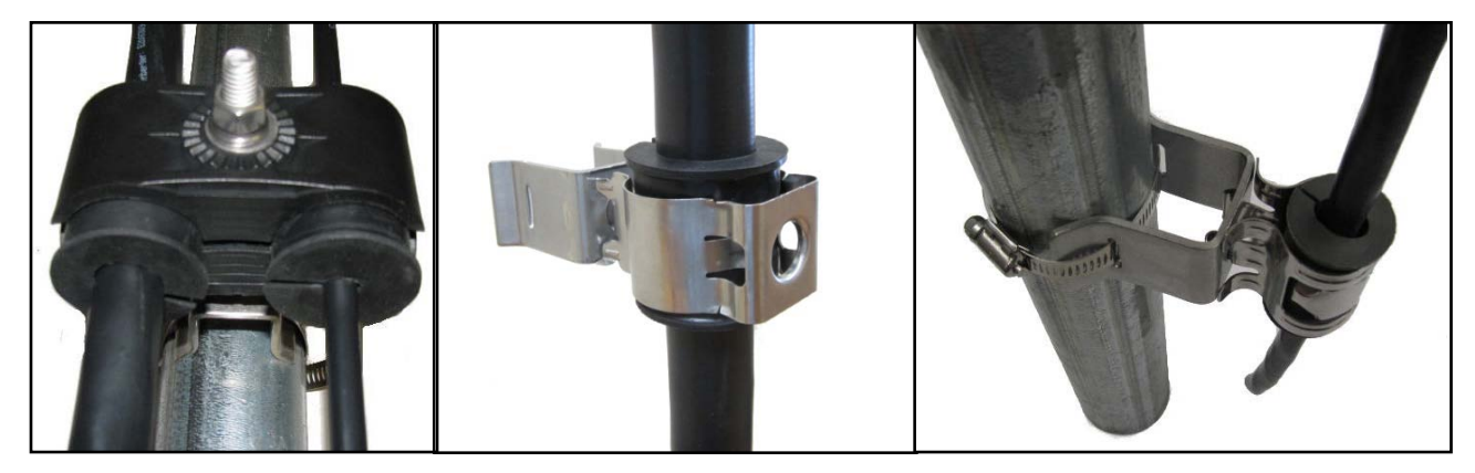
Grommets shown with cable and various coax hanger systems including Double Blocks, Snap-Stack Hangers and Universal Hangers

For use in High Risk PIM Zones, the products must be used in conjunction with other approved products